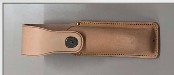
Accessory: Storage case